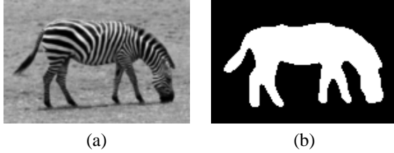
Figure 2: (a) Zebra image and (b) final segmentation.